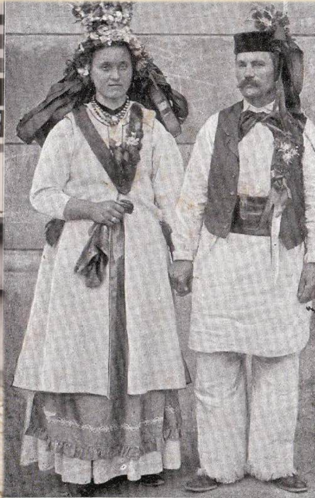
BELOKRANJSKI ŽENIN IN NEVESTA